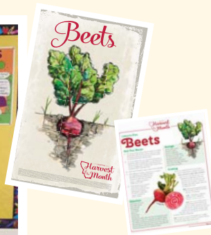
One of our goals for this project was to work on creating farm to school materials and resources for other communities in Montana to be able to use. Materials for the Cafeteria, Classroom and to send home are available for FREE. See the Resources section for how to access all of the Montana Harvest of the Month lessons, recipes, and promotional posters.