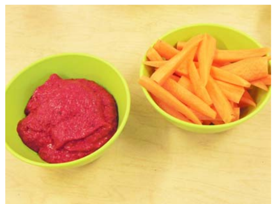
Middle school students make beet hummus to try with garden carrots!