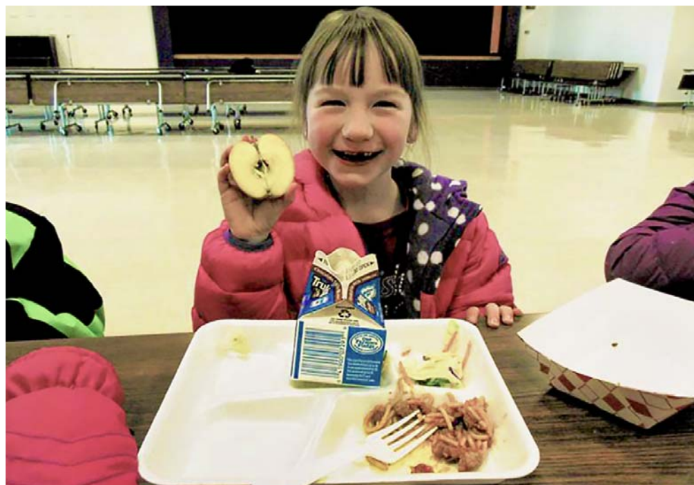
A second grade girl explained how Montana Crunch Time worked to five senior football players when they came to the elementary school for a lunch featuring local apples.

In 2013, NCAT applied for and received a USDA Farm to School grant to pilot a regional farm to school project in Butte and its neighboring town of Boulder. These two communities shared resources and came together for trainings, as well as provided an opportunity to learn about and contrast specific challenges in farm to school based on size and location. Butte has just under 35,000 people and is located on two major highways, with a school district comprised of six elementary schools all served by one central food service program. Boulder has under 1,500 people living there and has one elementary school with its own kitchen and food service staff. Over the course of the project, NCAT staff worked closely with stakeholders and leaders in these two communities to start farm to school work in the case of Butte, and to support the farm to school work already going on in Boulder. Read on for the story of growing farm to school in these two communities, a summary of our biggest successes, and access to the resources we created for your use.