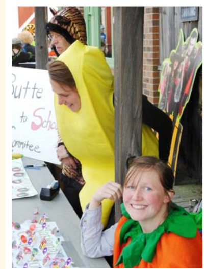
Members of the Butte Farm to School Committee handing out candy alternatives at a Halloween event. We also brought a sign-up sheet for the Farm to School Committee and a donation jar for the school gardens.

While assembling the team may be a first step, we tried to keep recruiting and assembling a stronger and bigger team the entire length of the project. As one person put it: "Takes time. People may come and go, so keep recruiting other members."