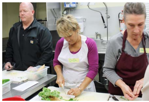
The staff from Butte and Boulder school kitchens participated in yearly skills trainings to help with some of the new recipes and foods being added to the menus.