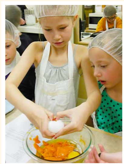
Butte High School Culinary Arts students hosted various elementary school classes to cook a recipe featuring the Harvest of the Month item, such as squash pancakes and carrot muffins. The kids loved the field trips and the recipes. "I could eat this for the rest of my life!" said elementary student.