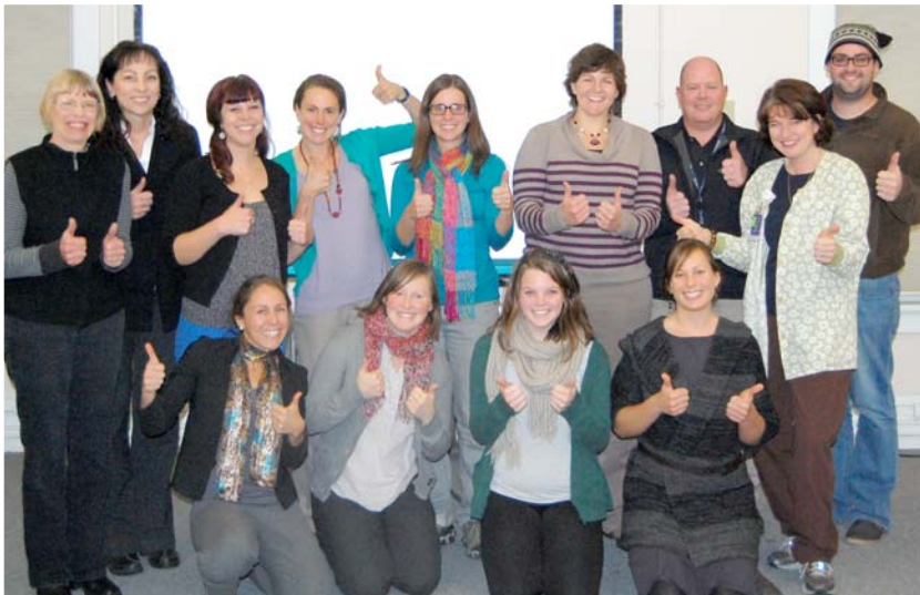
The Butte Farm to School Committee one year into the project: thumb's up for successes so far!

We found that it was really important and motivating to take time at meetings to review successes, such as recruiting a new volunteer, having parents and families come to a garden work day, or serving a new item on the lunch line. We shared success stories in meetings (small and large) and in email communications with pictures. At the end of each school year, we also held a gathering to share food and celebrate the progress we had made that school year, which was a nice way to go into the summer.