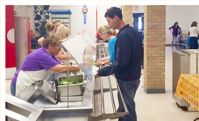
Bring in the celebrities! We held "Lunch with the Bulldogs" events where high school students ate lunch with the elementary kids. As one member of the Butte High School volleyball team said, "The kids look up to us, so what we do kind of makes them want to do it too. If we eat the salad maybe they'll think that they should eat it too!" The younger students learn about healthy eating from someone they admire and it provides a mentorship opportunity for the older students.