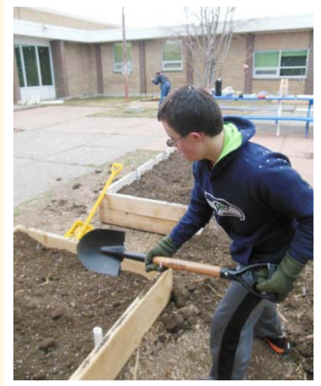
Volunteers, students, and school staff move donated soil into the newly built garden beds at West Elementary