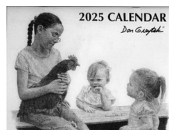
Greytak Calendars Available at Achievement Day