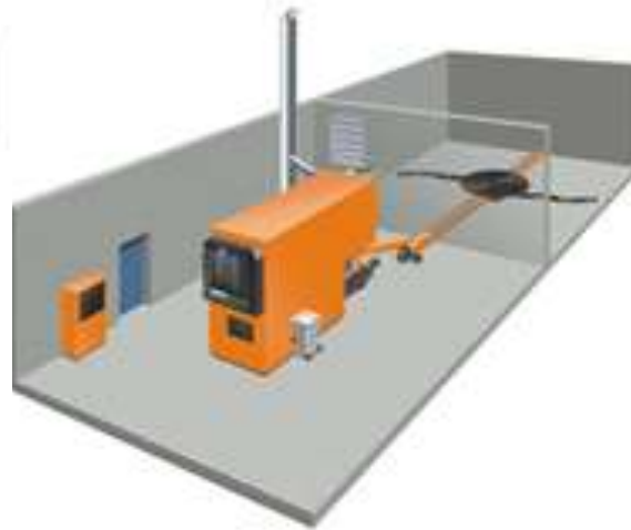
Rotary Arm to conveyor or auger