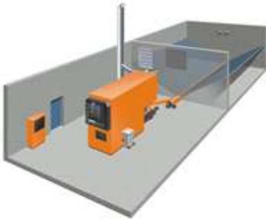
Rigid V-bottom with auger or vacuum system