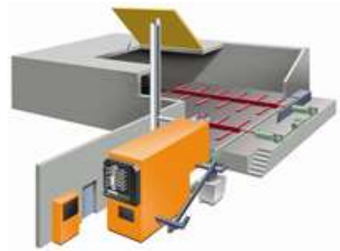
Moving floor or Sweeper Auger