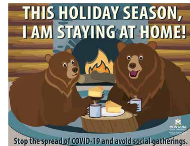
As one part of a state grant to MSU this fall (see page 8), CAIRHE and partners at Salish Kootenai College developed culturally relevant COVID-19 educational materials, including this poster, for college students and rural and tribal communities. More examples are found on CAIRHE's home page .

For complete details and instructions, visit https://www.montana.edu/cairhe/rfp/index.html .